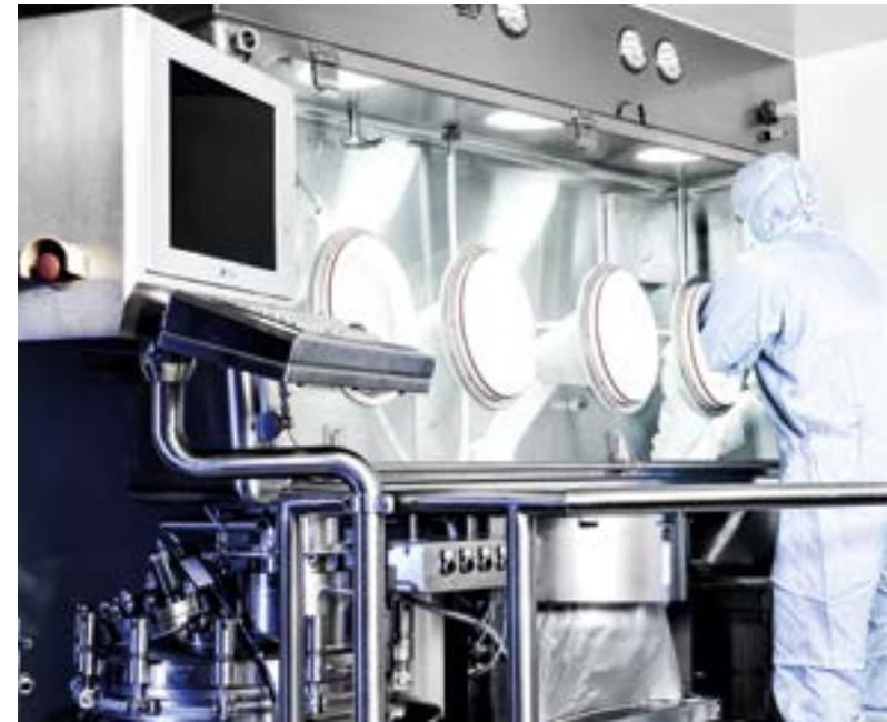
Formulation isolator with mobile vessel