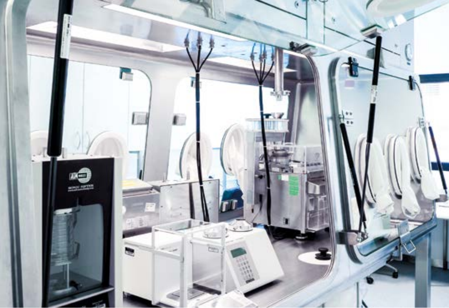
IPC laboratory isolator