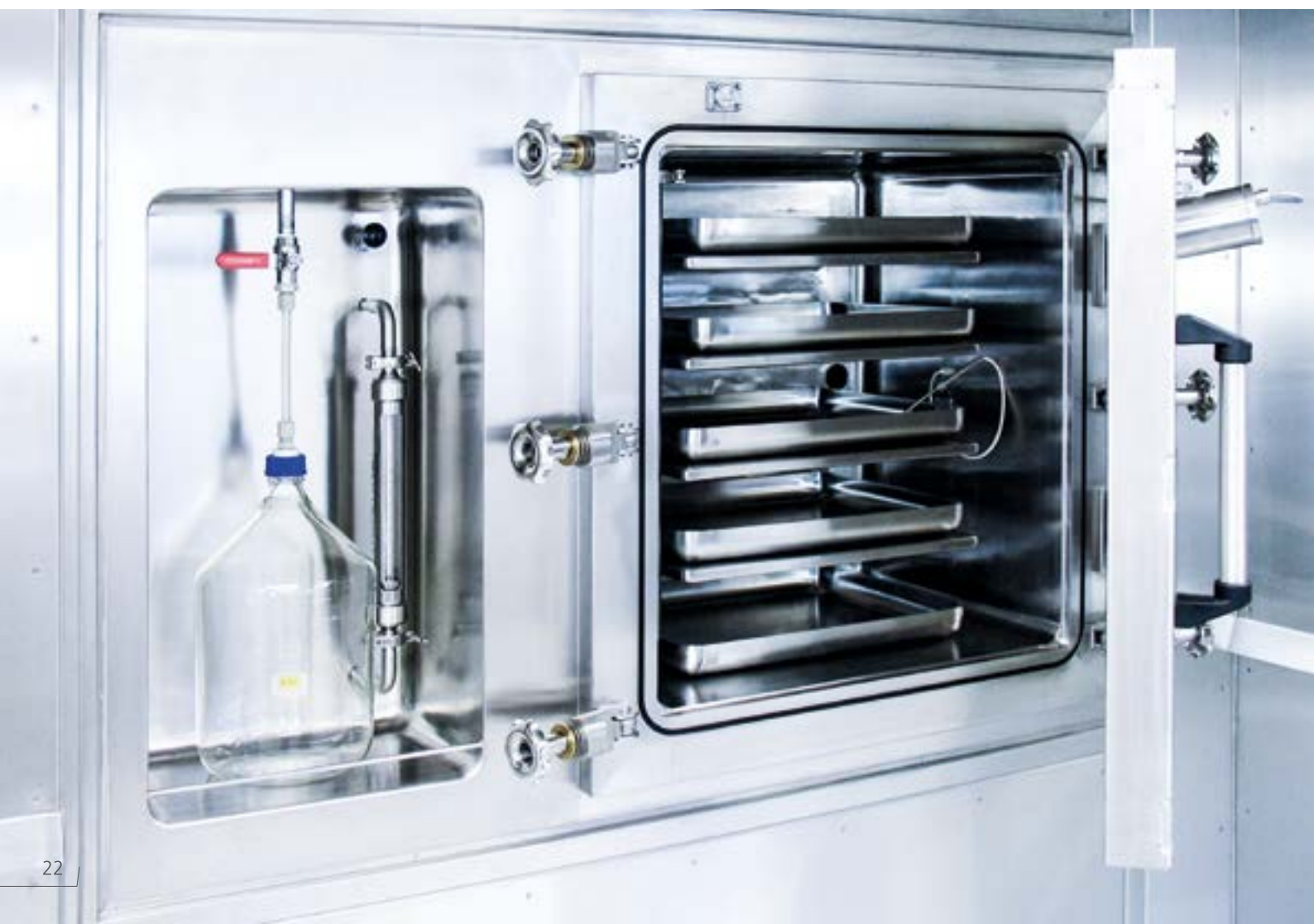
Package unit in cGMP-compliant design with 1.0 m 2 VTP vacuum tray dryer for a gentle drying of pharmaceutical substances.

The convective drying of products wetted with solvent and water in HC and HW rack tray dryers represents a universal drying process, which has proved itself in the chemical and pharmaceutical industry. Types HW and HC with drying surfaces up to 24 m 2 , differ in the manner of their construction and airflow. The HW tray dryer is designed as a cGMP-compliant design, while the HC tray dryer can be optionally equipped with built-in HEPA filters to retain dust from the product. The operating principle is similar for both modular assembled structures consisting of an integral fan, a heater and a condenser. Both types are characterised by the even distribution of the horizontal drying airflow over the trays. The dryers can either be operated in air-circulating mode or in partially fresh air mode. However products containing solvents being dried in a safe gas loop process with an inert gas blanketing in compliance with the ATEX Directive 2014/34/EU. Both tray dryers can be heated by steam or electrically and are characterized by their pharma-compliant quality finish and last but not least by tightly-closing cabinet doors. Above all, our HW dryer is designed to be easy to clean: all components wetted by the product are very well accessible. Even the air baffle elements can be easily unhinged and swiveled away. Our mobile tray trolleys ensure convenient and efficient handling of the product trays inside and outside the tray dryer.