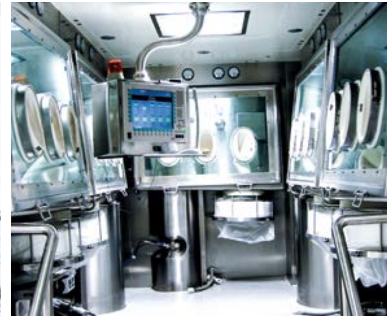
Isolators with directly integrated compounding vessels for parenteral production