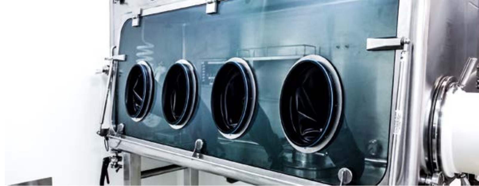
EX-protected isolator with removable 1 litre preparation vessel