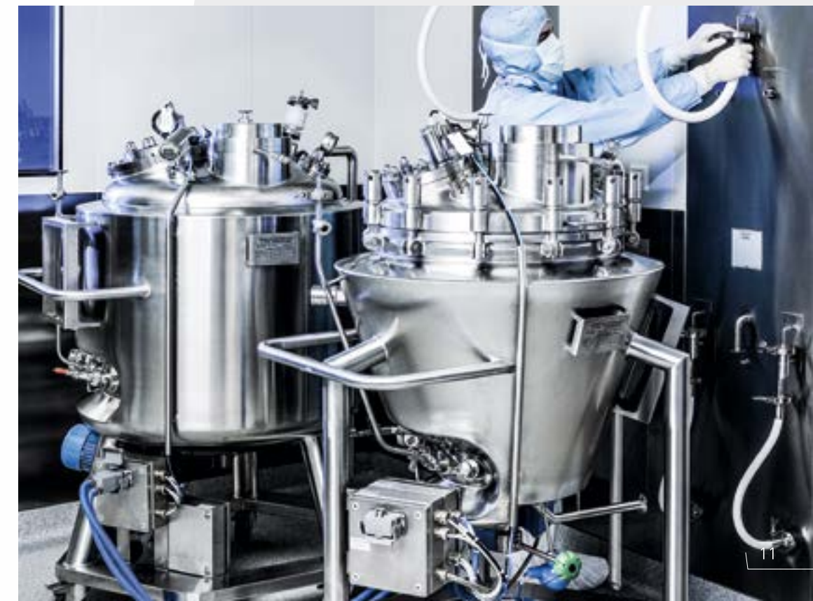
Mobile preparation vessels in front of the filling panel

Do you need isolators, drying cabinets or other vessels to fit your system? These are all WALDNER products that we are happy to combine with our systems. Naturally, we are also able to integrate other manufacturers' process equipment. You receive everything perfectly coordinated from a single supplier. Simply get in touch with us – we'll find the right solution for you.