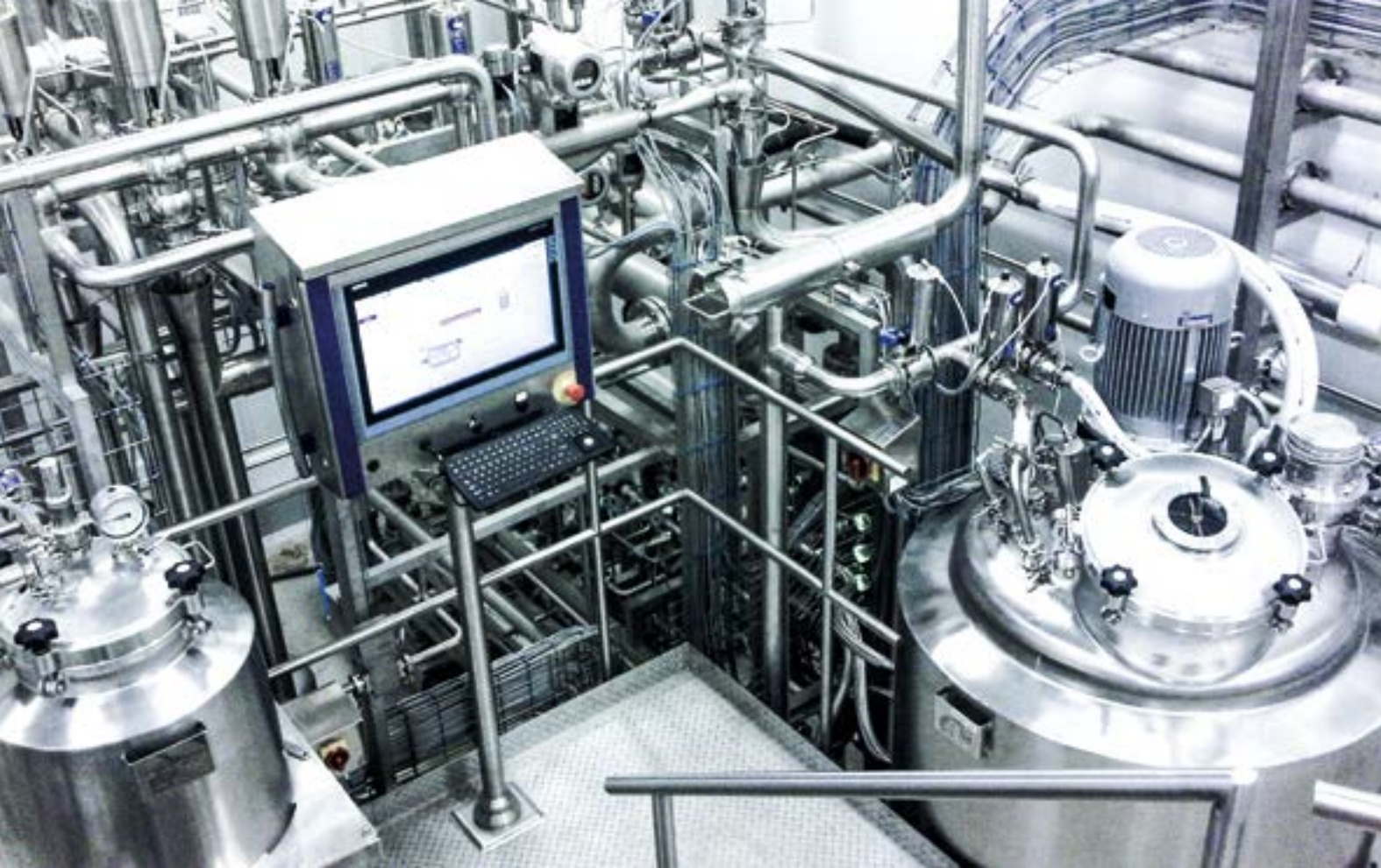
Detail of a cooking line with aroma vessel and binding agent station