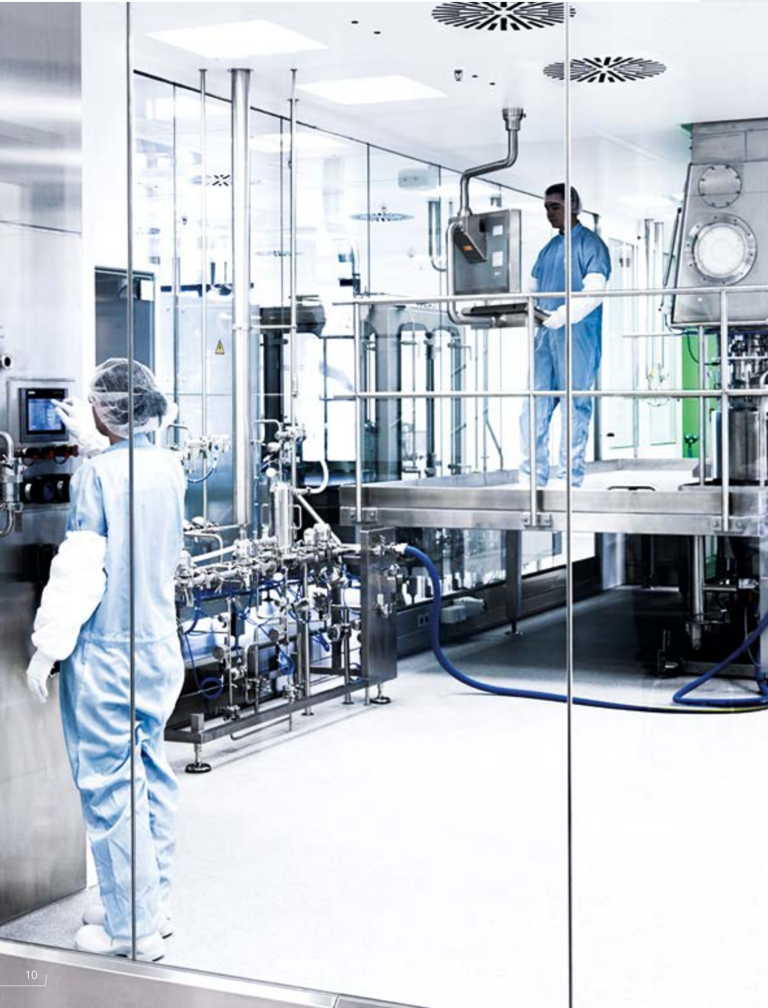
Formulation line with filter skid

Do you wish to add functions to your system or do you immediately need an entire functional system? Not a problem: we are your one-stop shop for vessels and package units right through to custom-made complete process lines. Our core expertise includes the batching of liquid products, such as buffer solutions, as well as the mixing and handling of viscose products under aseptic/sterile conditions. On request, we will combine your system with our isolators or a suitable solids handling system. CIP and SIP units are naturally factory-integrated into our systems.