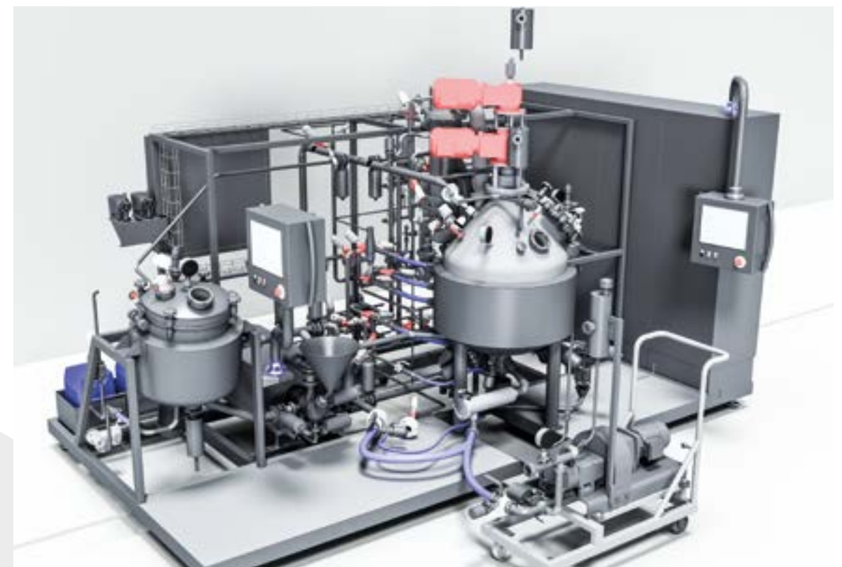
3D-model of a vertical pilot plant

Whatever you produce – our aim is to provide you with a process that delivers consistent quality that remains transparent and controllable at all times.