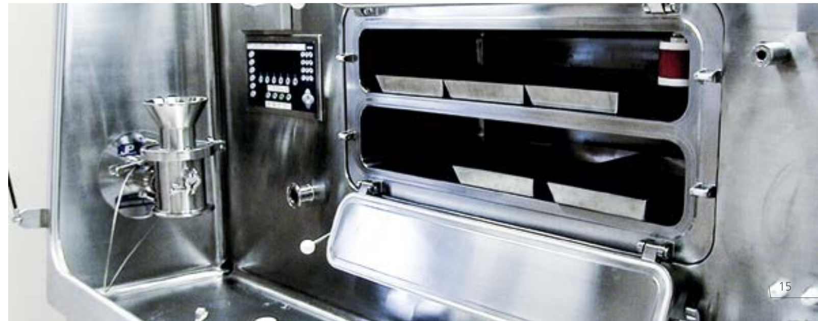
Isolator with integrated vacuum tray dryer and sieve mill