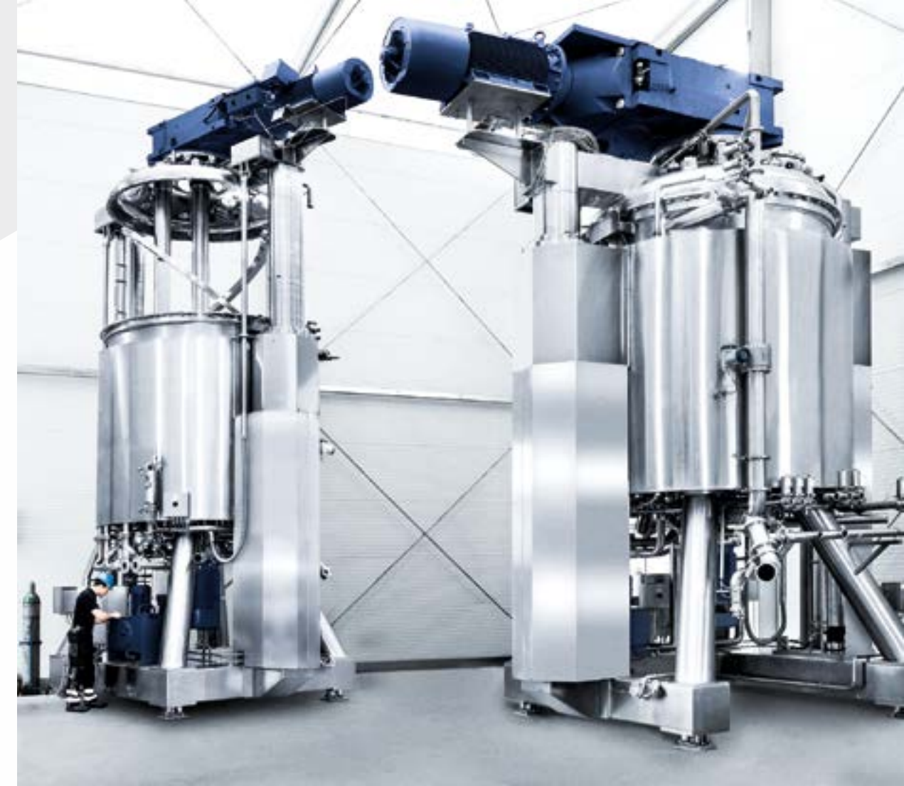
10,000 litres mixing vessel

Our engineers will supervise your project from engineering through to factory handover with inspections, including non-destructive testing with X-ray fluorescence, surface roughness testing or CIP cleaning certification using the riboflavin test. We track our material with quality measurements from delivery to installation and functional testing. And naturally we also install our vessels in compliance with all current regulations, including ATEX, PED, AD2000, DIN EN 13445, ASME, China Licence and TR certificates, ensuring you are perfectly equipped for all markets.