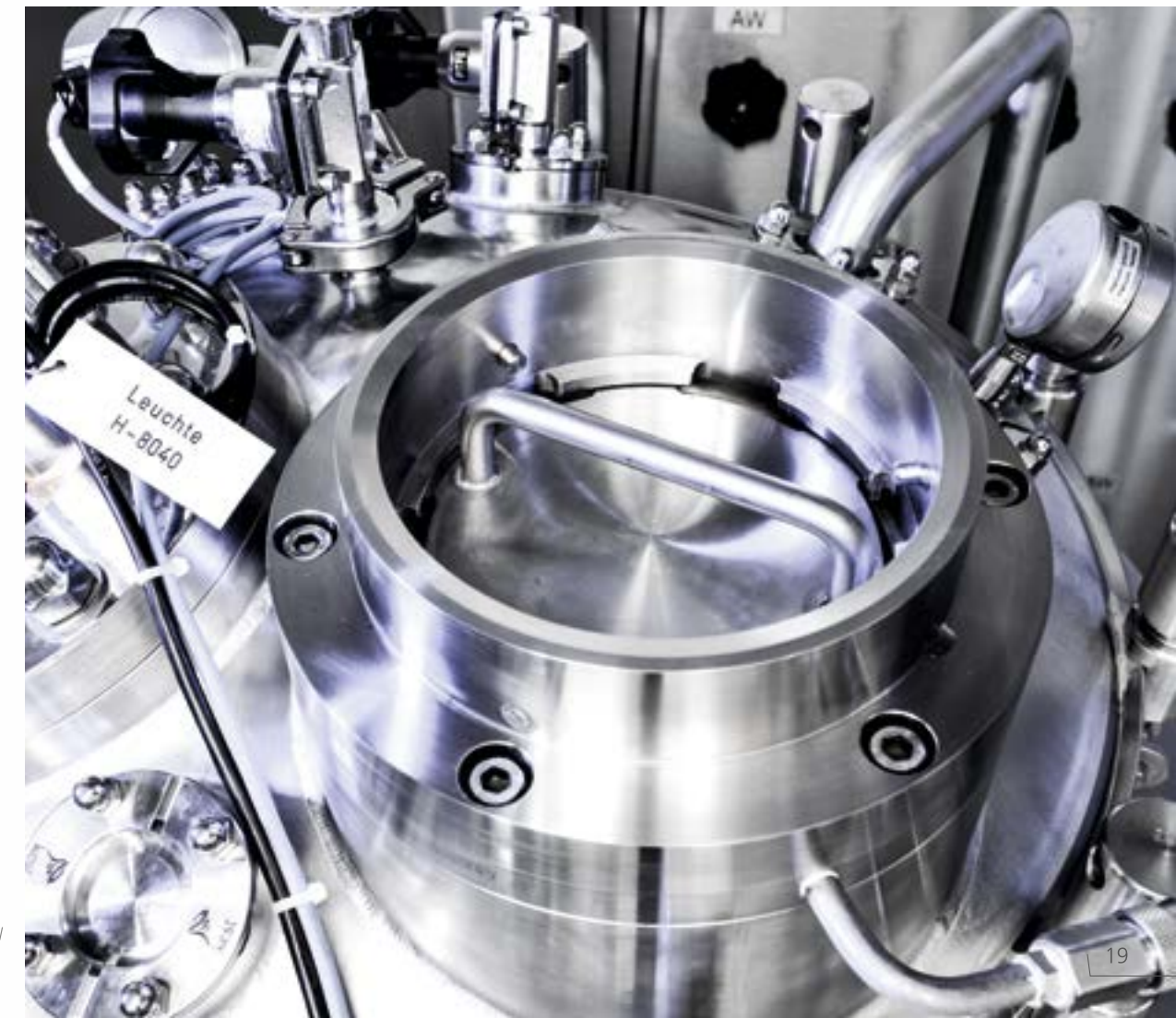
Mobile preparation vessel with WALDNER docking system