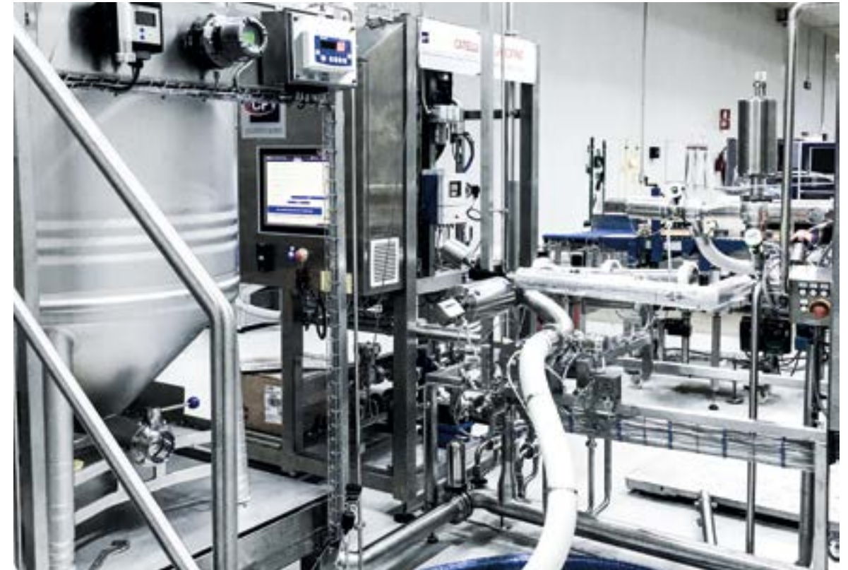
Container filling station

Professionals know: scaling up a recipe to a large system doesn't necessarily succeed just by making things bigger. Decades of experience have shown us how even your grandmother's favourite recipe can be scaled up – in appearance, quantity, flavour and taste. At the same time, our many years of experience in the pharmaceutical industry ensure the long shelf life of your products.