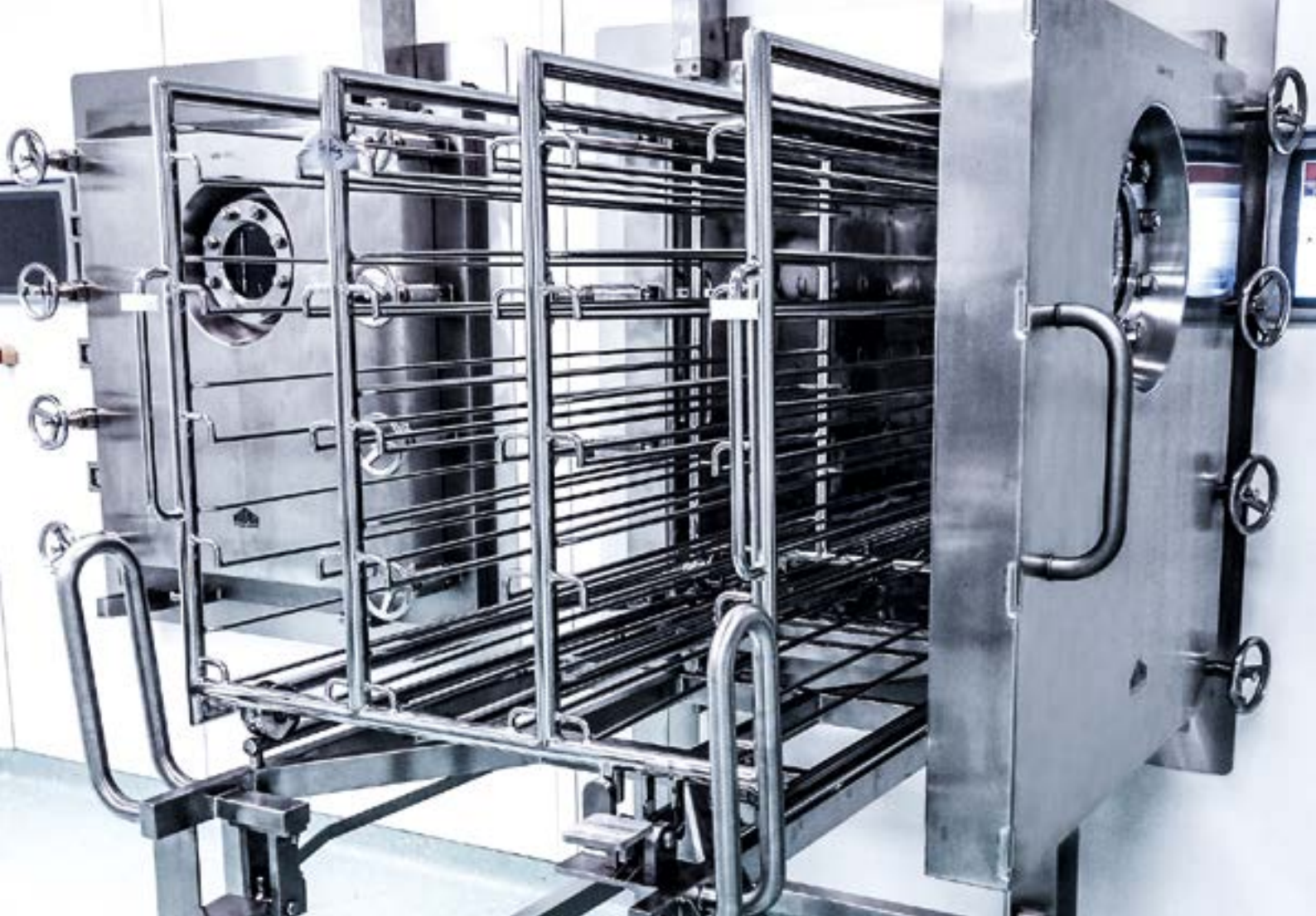
Vacuum tray dryer with retractable rack trolley for the drying of pharmaceutical products