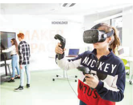
Scan and view the video